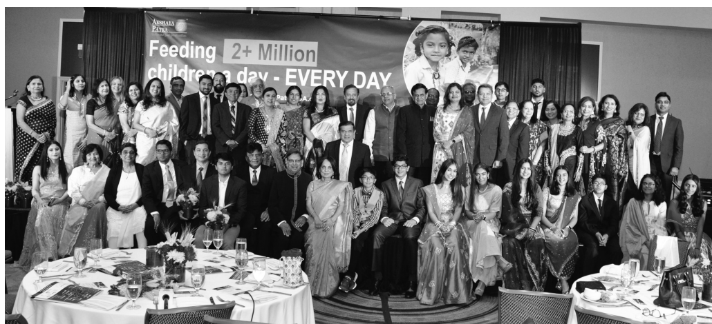
The Akshaya Patra serves over 2 million school children in over 20,000 government schools across India