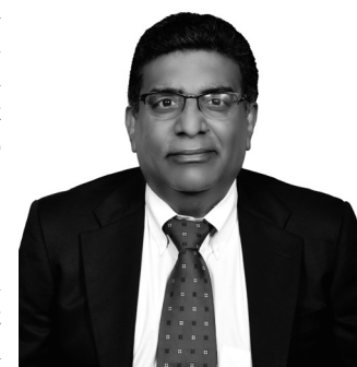
$5 million funding is part of the 2022 omnibus appropriations bill

“After decades of painstaking preparation and lab tire testing, AEG is finally poised for manufacturing, with the first pressure “Zero” tire will be delivered in 2023 bringing this